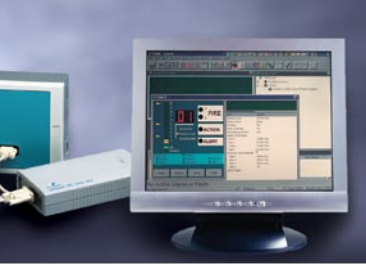
Both VSC and ASPIRE2 are backwards compatible with the VESDA Laser-Based detector family.